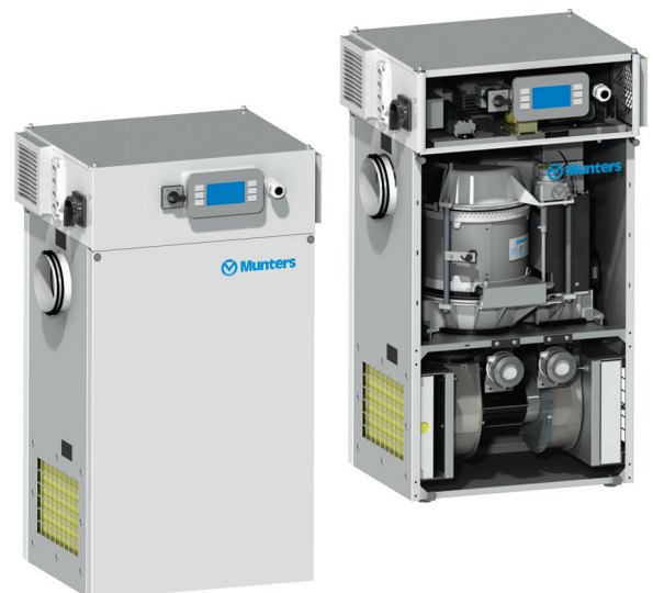
ML with Climatix Controls

ML Series dehumidifiers conform to both harmonised European Standards and to CE marking specifications.