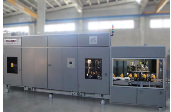
Unscrambler model MONOCHUTE-45 with POSIFLEX changeover system and integrated Rotary Orientor in monoblock.