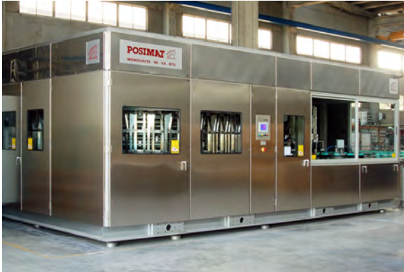
Unscrambler model MONOCHUTE-40 with POSIFLEX changeover system, integrated BTU* in monoblock and soundproof cabin in stainless steel

The top of the machine is fitted with a split lid reducing noise emission as well as preventing access to the machine whilst is operating.